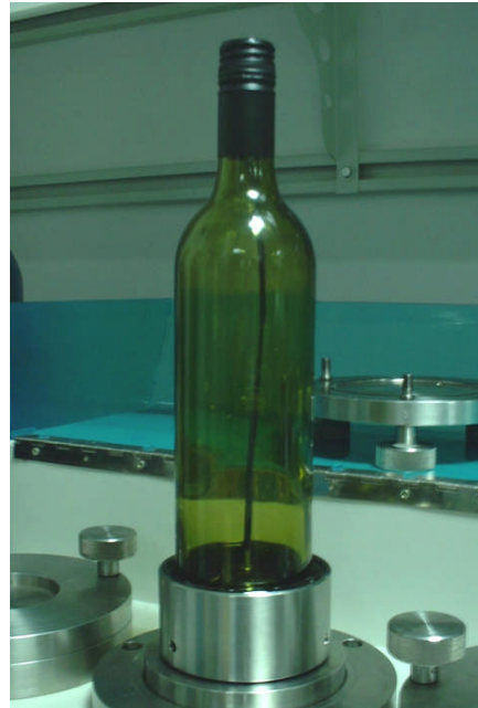
Figure 1. Finished Bottle Body Specimen for Water vapor permeability Testing