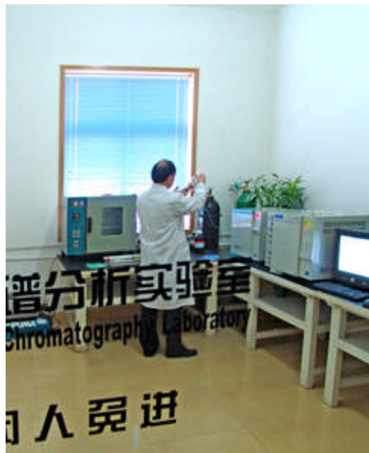
Figure 3. Chromatographic Analysis Lab

study of aroma separation, solvent residue analysis of complex package. It can provide services of establishing analysis method, data test, and staff training on solvent residue controlling of package materials. Labthink GC-6890 and GC-7800 special gas chromatographic instrument for solvent residue test of complex package can provide test for commission service to customers. It can also perform data comparison of several labs. In the future, this lab will also carry out thorough and careful research of global advanced research subjects on permeation principle of organic gases in polymer, on selective controlling and test.